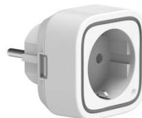
Aeon labs Aeotec Smart Switch 6