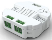
Aeon labs Aeotec Micro Switch G2

heatapp! single floor is a switchable radio outlet or alternatively an concealed switch relay to the circuit of electric heating appliances, for example infrared heatings or fan heater. There are three variations of Z-Wave products from free trade, recommended by EbV heatapp! single floor . These devices are heatapp! checked and can be integrated in heatapp! systems. (Relation about specialised trade!)